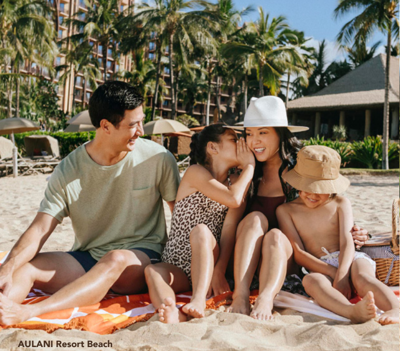
AULANI Resort Beach