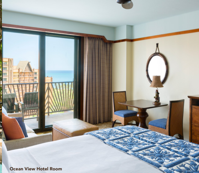
Ocean View Hotel Room