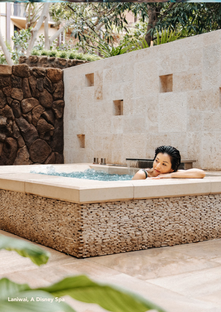
Laniwai, A Disney Spa