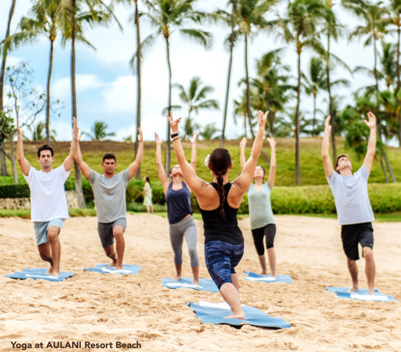
Yoga at AULANI Resort Beach

Let your legend begin when you escape to AULANI, A Disney Resort & Spa in Ko Olina, Hawai‘i. Located on the white sand beaches of O‘ahu, AULANI Resort was designed by the people who know families best: Disney. There’s something for everyone—from the youngest to the oldest.