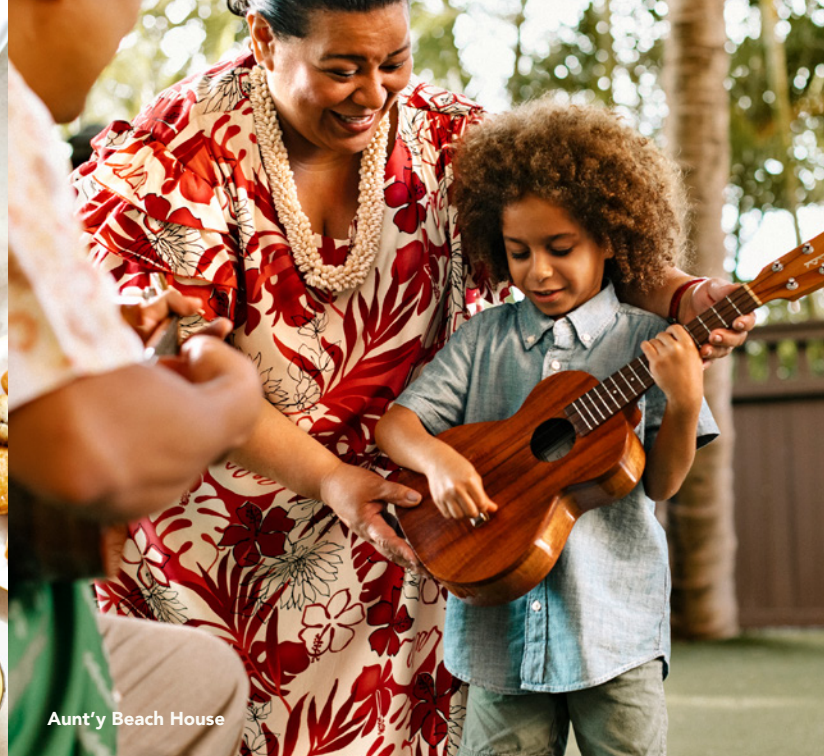
Aunt'y Beach House